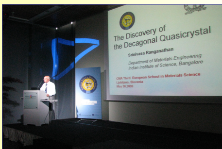
MONS Congress Centre